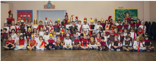
Scenes of fun: some of the action from St Teresa's Roman day